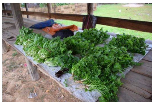
Photo 6. Vegetables sold in a roadside store