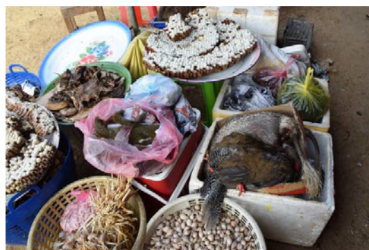
Photo 8. Hunted wild creatures sold in Phonsavan market