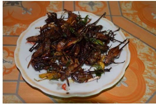
Photo 10. Cooked katydids at the restaurant in Sopbao, Houaphan