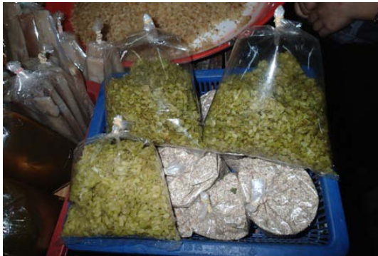
Photo 11. Toasted immature rice (Khao-mao) sold in Phonsavan market