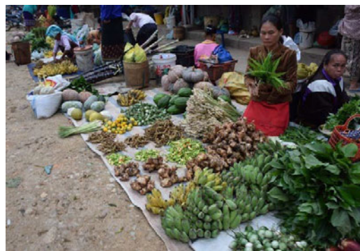
Photo 2. Vegetables sold in Muang Sam 1 market in Sam Neua