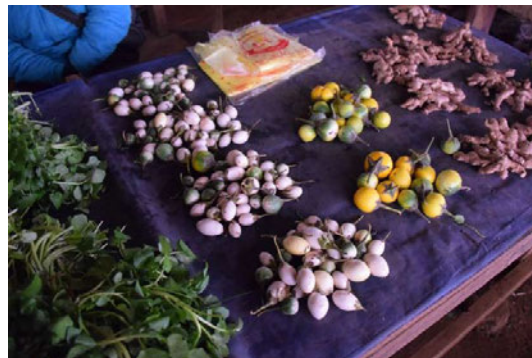
Photo 4. Eggplants sold in the market in Sam Tai in Houaphan