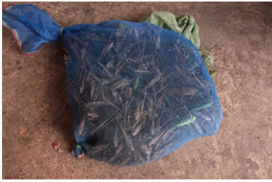
Photo 9. Mixed katydids sold in the town market in Nam Neun, Houaphan