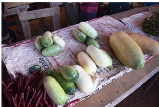
Photo 5. Cucumber sold in the Sunday market in Ban (village) Nongpet, Xiengkouang