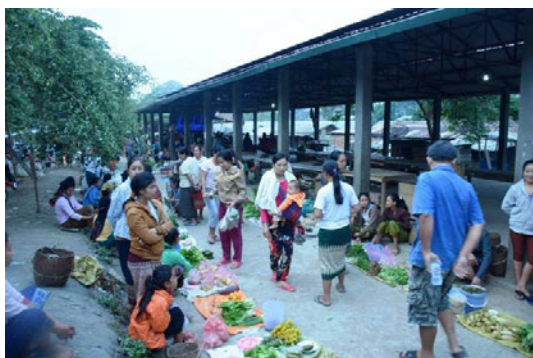
Photo 3. Vegetables sold in town market in Muang Et