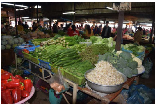
Photo 1. Vegetables sold in Phonsavan market