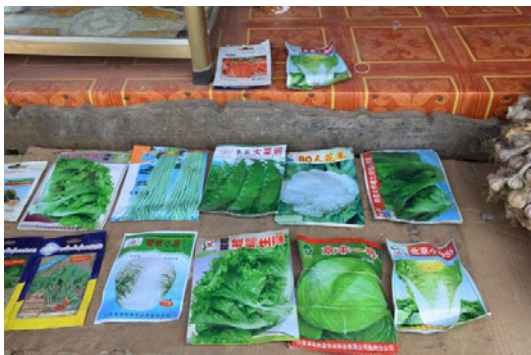
Photo 13. Imported seeds sold in Hetsaban market, Muang Phoukoud, Xiengkouang