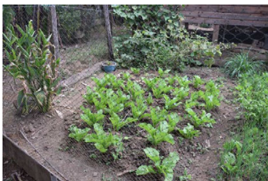
Photo 7. Vegetables cultivated in home garden of farmhouse in Pong Man village