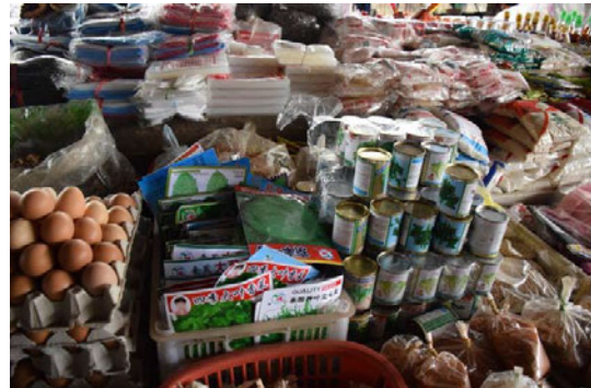
Photo 14. Imported seeds sold in a town market, Muang Nohghet, Xiengkouang