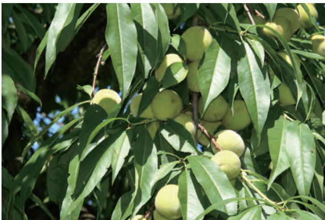
Photo 5. A local race of peach growing in an orchard, Hachimantai City (Table 2, No.8)