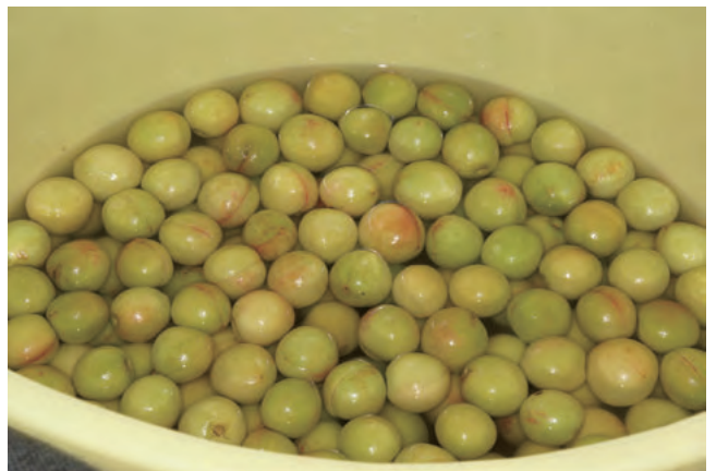
Photo 6. Making pickles from peach fruits, Hachimantai City (Table 2, No. 5,6)