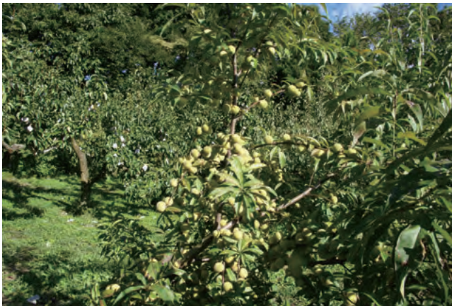
Photo 3. A local race of peach growing in an orchard, Takizawa Village (Table 2, No.2)