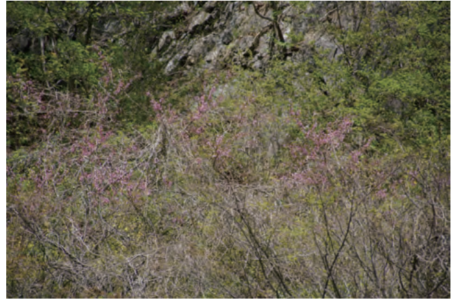
Photo 2. Wild peach trees growing at a limestone rocky slope, Iwaizumi Town (Table 1, No.8)