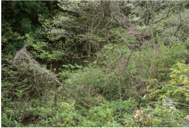
Photo 1. A wild peach tree growing at riverbank, Ichinoseki City (Table 1, No.1)