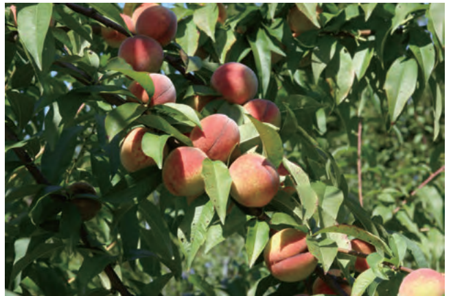
Photo 4. A local race of peach growing in an orchard, Hachimantai City (Table 2, No.7)