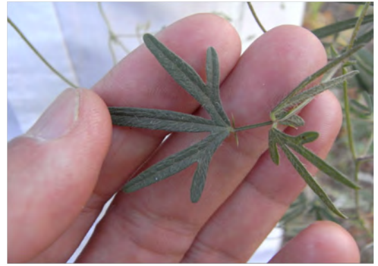
Photo 2. A wild form of moth bean like plant (TN67) found in Viluppuram Province. It grows in a sandy sorghum field with V. trilobata (TN65).