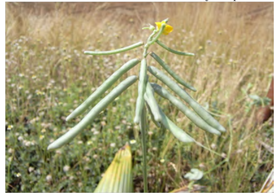
Photo 8. Big cultivar-like pods of V. trilobata suggesting some extent of domestication. Cultivation and human consumption of V. trilobata are confirmed in Tamil Nadu.