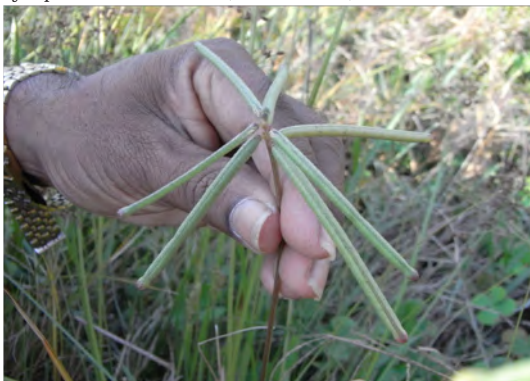
Photo 5. Pods of Vigna stipulacea (TN35). This species prefers wet habitats and is frequently found in and around heavy clay paddy fields.