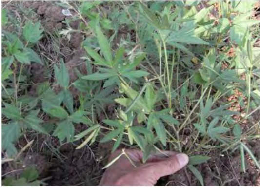
Photo 1. A “Cultivated Type” of moth bean (TN119) shows erect short main stem. Farmers prefer this type because of easy harvesting.