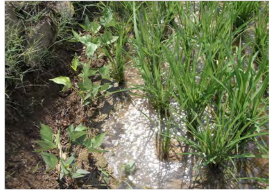
Photo 4. Unlike mungbean which is usually grown on dry land, black gram is frequently cultivated on the ridge or near the paddy field.