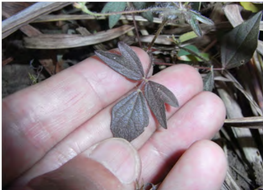
Photo 3. Another wild form of moth bean like plant (TN66) which has broad purplish leaflet growing sympatric with TN67 (see Photo 2).