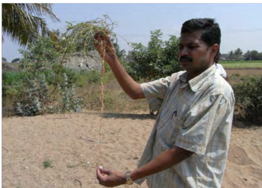
Photo 7. A long tap root of Vigna trilobata (TN69) growing on sandy soil beside farmers house suggesting high drought tolerance. However, no nodules are found.