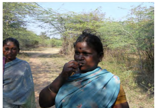
Photo 6. A farmer eating immature seeds of V. stipulacea (TN95). It is used as leafy vegetable, green manure and fodder for cattle. Mature seeds are eaten fried and also made into curry soup.