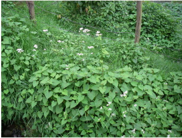
Photo 1. Wild buckwheat at Udakamandalam.