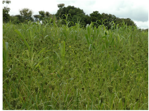
Photo 2. Interplanted field of finger millet and sorghum.