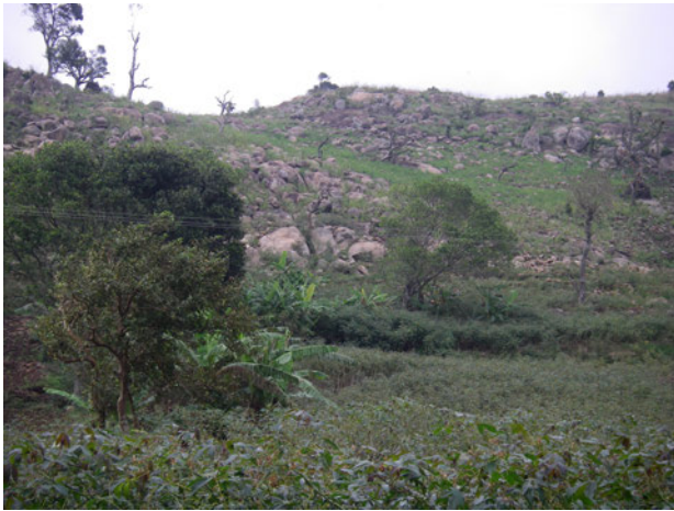
Photo 3. Slash and burned field.