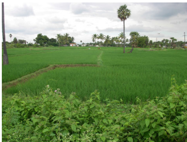
Photo 5. Paddy fields in the plain.