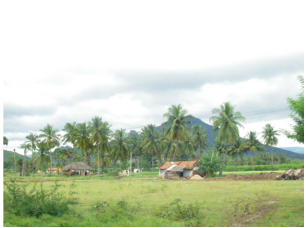
Photo 4. Landscape at plain area.