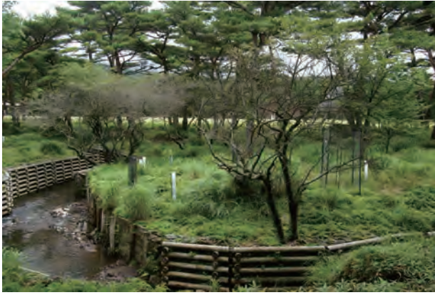
Photo 1. Natural growing habitat of Malus spontanea in the Ebino-kōgen high plateau (3 Aug. 2012)