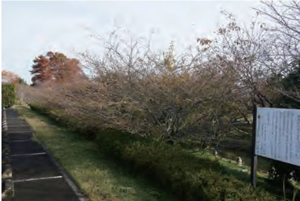
Photo 3. Cultivated trees of "Takanabe kaidō" at the Takanabe Museum of Art, Takanabe Town (1 Dec. 2012)