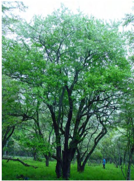
Photo 1. A tree of Malus baccata var. mandshurica , from which epitype specimens were collected 5) . Senjugahara, Nikkō-shi, Tochigi Pref.