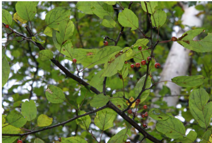
Photo 2. Infructescences of Malus baccata var. mandshurica . Senjugahara, Nikkō-shi, Tochigi Pref.