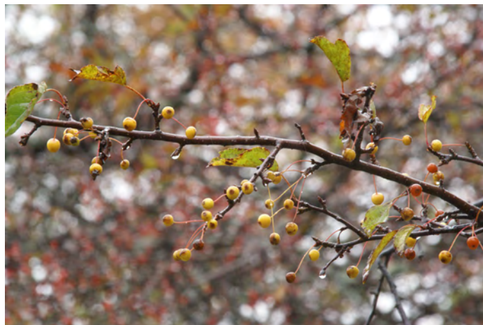
Photo 3. Infructescences of Malus toringo (yellow type). Senjōgahara, Nikkō-shi, Tochigi Pref.