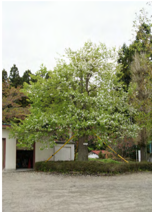
Photo 6. A tree of Pyrus pyrifolia . Cultivated in the schoolyard of the Kobyaku Elementary School, Nikkō-shi, Tochigi Pref.