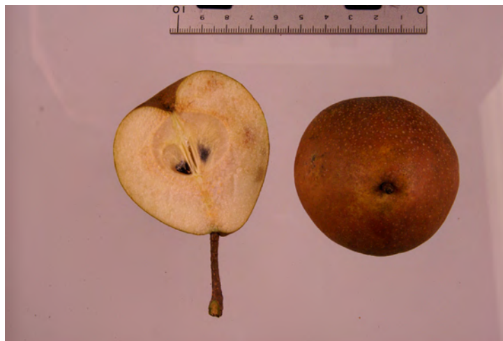
Photo 5. Fruits of Pyrus pyrifolia collected from the tree of the Kobyaku Elementary School.