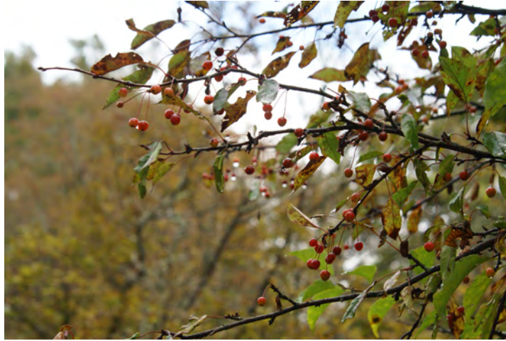
Photo 4. Infructescences of Malus toringo (red type). Senjōgahara, Nikkō-shi, Tochigi Pref.