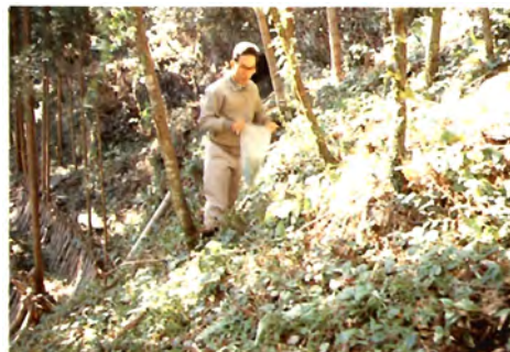
西米良村村所 しいたけ栽培をしている農家の裏山 竹林の中にもヤマチャが点在している。