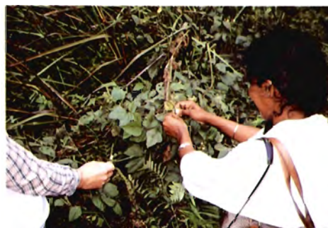
星立近くの道路添いの林縁にて V. reflexopilosa の収集