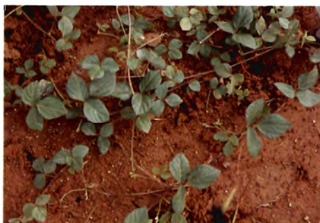
Vigna riukiensis ，中野バス停近くの荒地にて