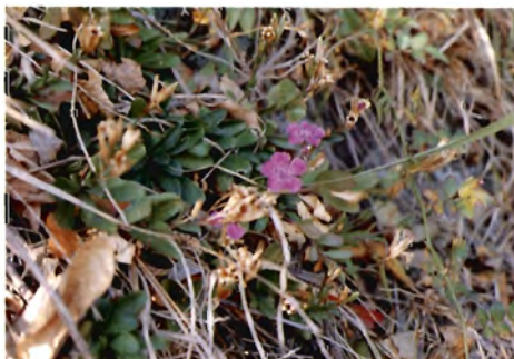
ヒメハマナデシコ ( D. kiusianus ) の自生状況 (鹿児島県川辺郡坊津町地内，沿海部砂礫地)