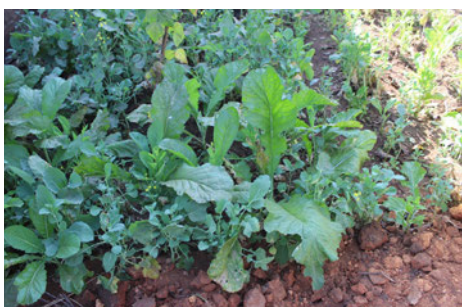
Photo 23. Several Brassica vegetables grown in the same field.