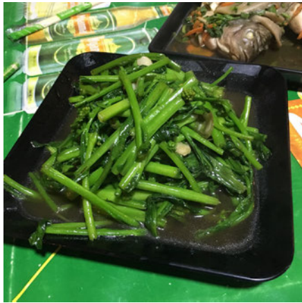
Photo 1. Stir-fried vegetables with Mohn Nyin.