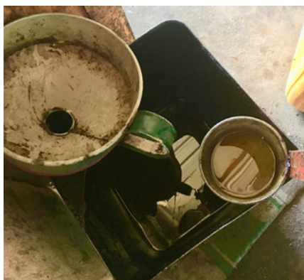
Photo 9. Mohn Nyin oil sold at local shop, Naung cho Township.