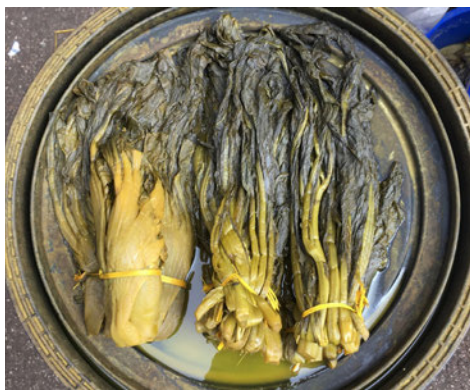
Photo 3. Pickles of Mohn Nyin.