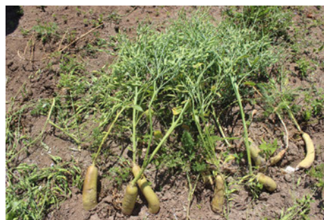
Photo 18. Radish ( Raphanus sativus ) produced for edible roots and fruits.