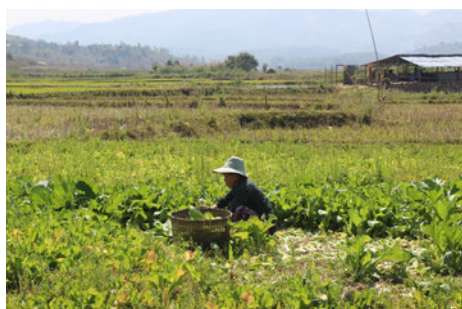
Photo 13. A farmer harvesting B. juncea in the field.