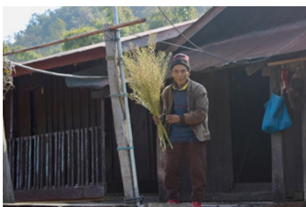
Photo 17. Harvested Brassica seeds.