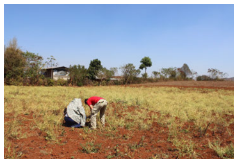
Photo 20. Raphanus sativus for oil waiting for harvest, Heho Township.