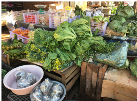
Photo 5. Mohn Nyin sold at the Maymyo market in Myanmar.