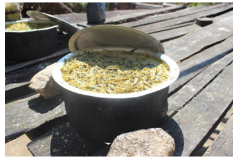
Photo 4. Pickles of Mohn Nyin's flower stem.