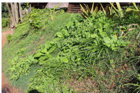
Photo 7. Local varieties of Brassica plants growing in a commercial field, Kalaw Township.