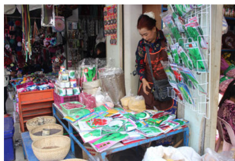
Photo 14. Seed shop with many improved varieties, Tachilake Township.