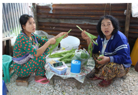
Photo 12. Pretreatment of Mohn Nyin for processing, Baw Lon Gyi Village, Mogok Township.