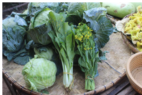
Photo 22. “Mohn Nyin Phyu,” white mustard; “Mohn Nyin Sein,” green mustard sold in Yezin market.