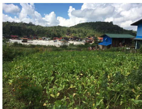
Photo 10. Mohn Nyin field and jewelry quarry, Baw Lon Gyi Village, Mogok Township.