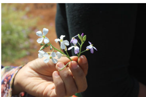
Photo 19. White and purple flowered radishes observed in the field, Loilem Township.