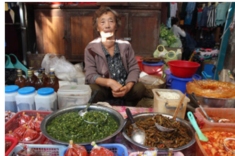
Photo 6. Pickles of Mohn Nyin sold at the Maymyo market.