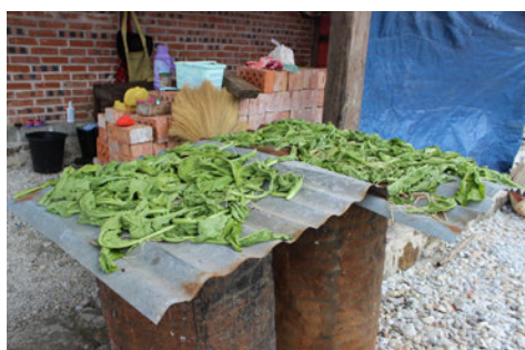
Photo 11. Drying Mohn Nyin, Baw Lon Gyi Village, Mogok Township.