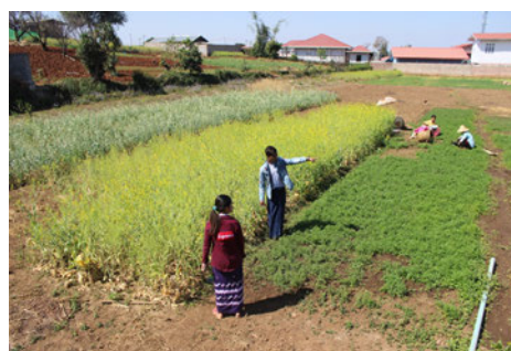
Photo 16. Seed production field, Taunggyi Township.